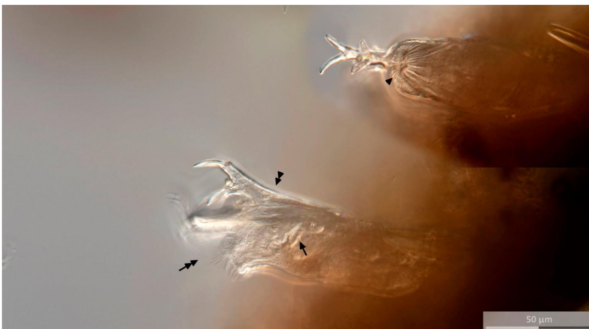
Fig. 3: Fully expanded rotifer in lateral view in median optical section showing base rod and 3 of 4 hooks of the nuchal fork (double arrowhead), trophi (arrow) and fully opened corona. The inset above right shows the rotifer in ventral view with fully retracted somatic body, which allows an unimpeded view of the four hooks of the nuchal fork. Scale bar indicates 50 µm.