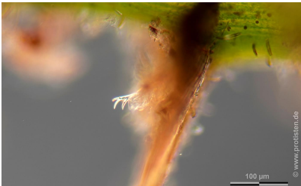
Fig. 1: Ptygura kostei on a Java moss ( Taxiphyllum barbieri ) filament. The somatic body is retracted, the characteristic nuchal fork can be seen with three of the four hooks of approximately equal size. Scale bar indicates 100 µm.

On the Java moss filaments, Ptygura kostei was found attached to the axils.